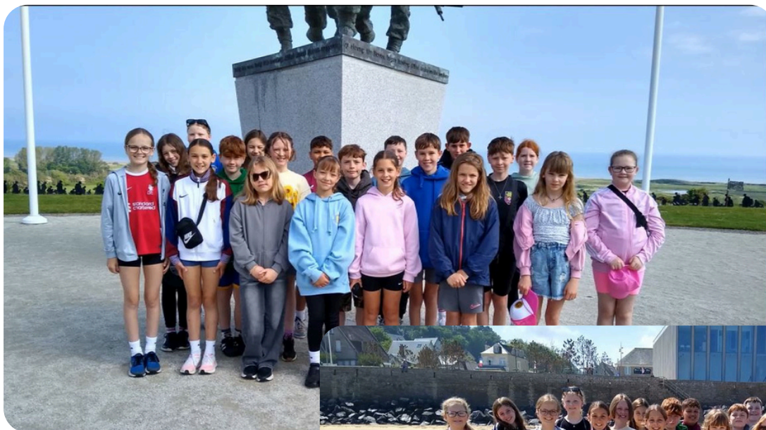
Year 6 Educational Visit to Normandy 20 th - 23 rd May 2025