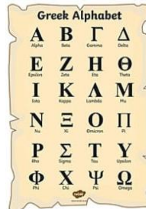
Ancient Greek alphabet

The Greeks all believed in Gods and Goddesses. They thought they had power over everything.