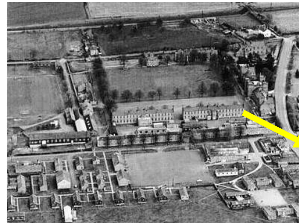
Aerial view of the barracks showing part of the Second World War development.