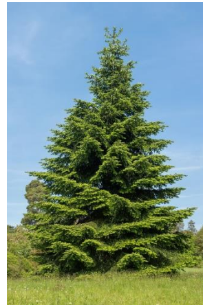
This fir tree is evergreen.

An evergreen plant does not lose its leaves in winter.